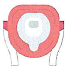
CPR pocket mask